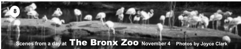
Scenes from a day at The Bronx Zoo November 4